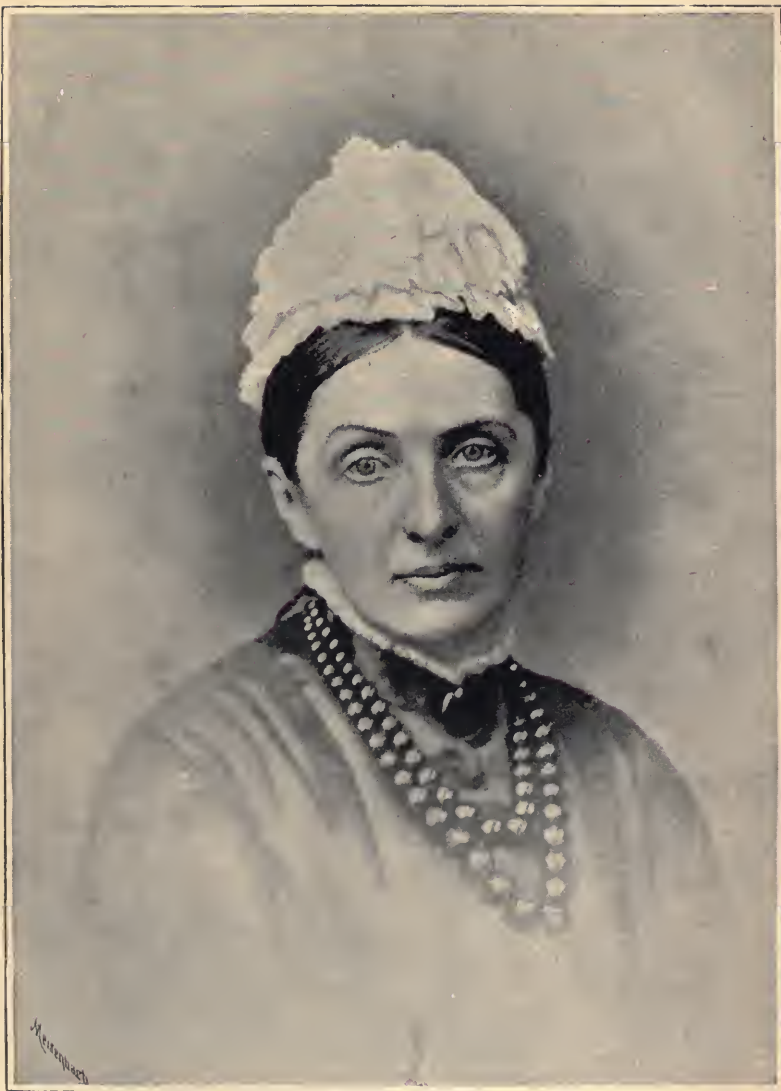
MRS. BISHOP (ISABELLA L. BIRD).